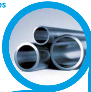
Seamless and welded cylinder tubes