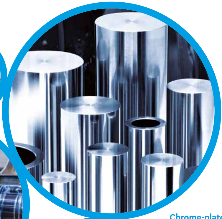
Chrome-plated piston rods & piston tubes